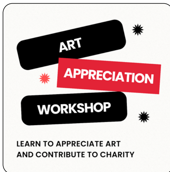
Art Appreciation Workshop