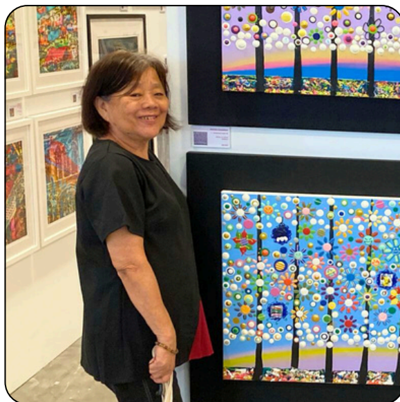
Affordable Art Fair 2025 Outing